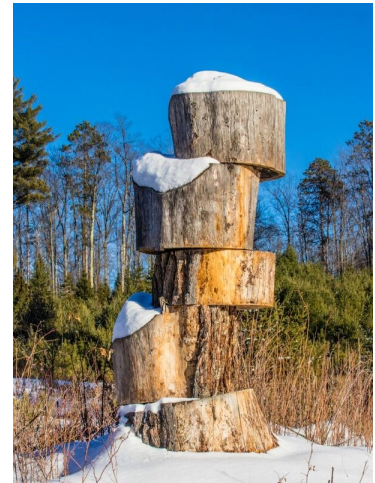
Art is Everywhere!