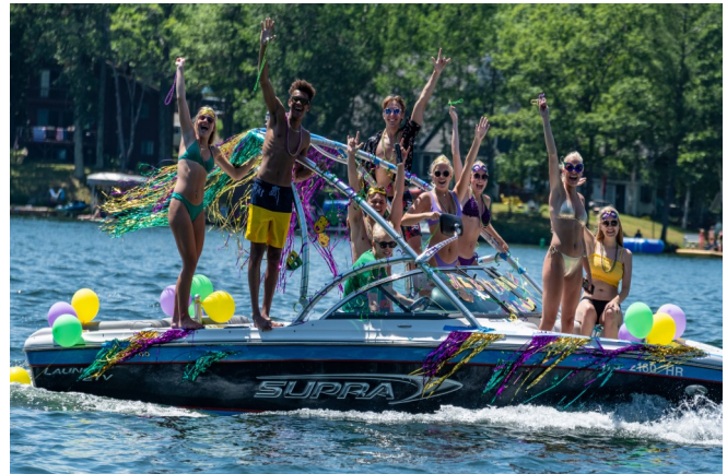
Team Spirit Award Mardi Gras