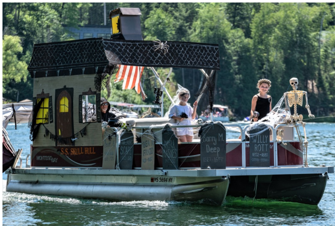
3rd Place Halloween