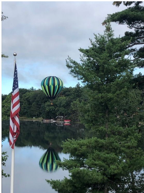
Magic morning on the Bass Lake