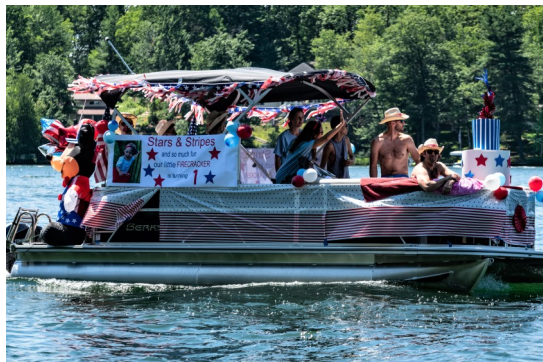
Just too cute!