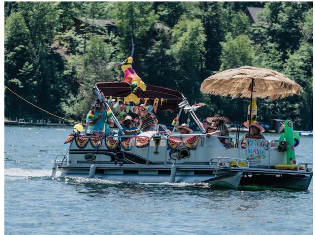
2nd Place Cinco de Mayo