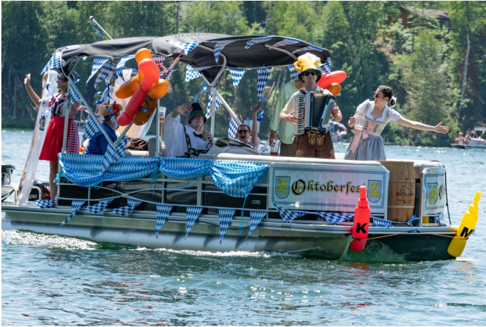
1st Place Oktoberfest