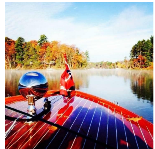
Last ride to the Landing