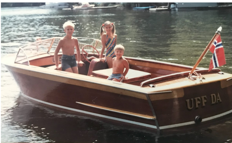
UffDa with the Kaad children 1985