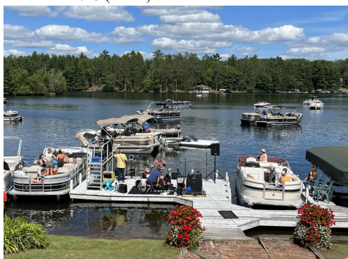
Lake Jam 2023 (below)