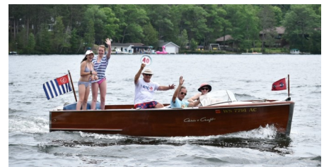
Timeless- Wooden Boats!