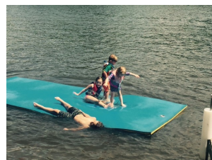
Fun times on July 4th!