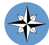
Food, Fun & Fiddles

The last SECOLA dinner of the season was held at the historic Encore building in Florence. It was a night we will long remember.