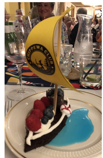
"Come Sail Away with Us" Chippewa Club Style