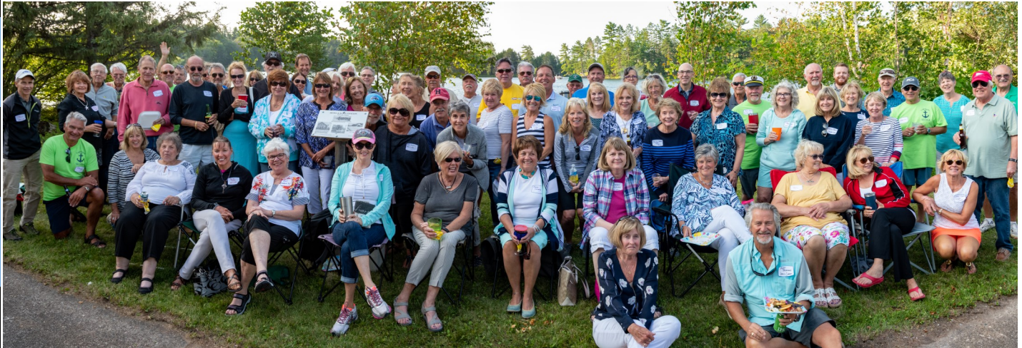
Bass Island Party July 2019